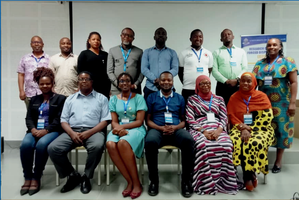
A group photo taken during the symposium, featuring government officials, stakeholders, and representatives from international organizations.