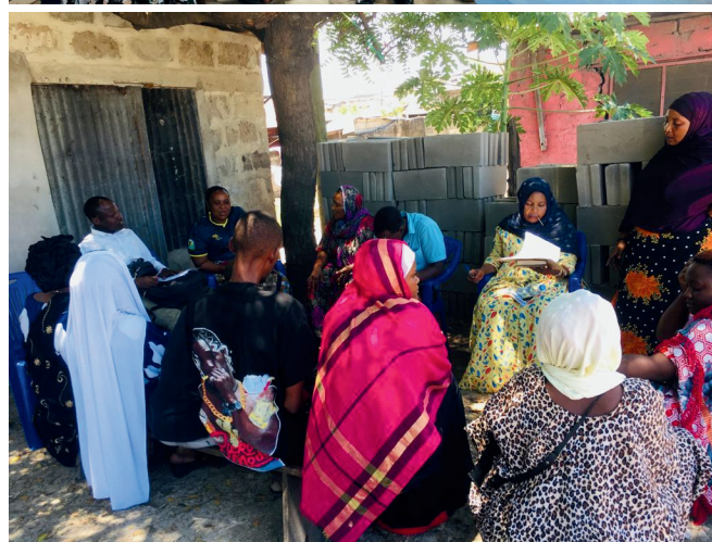
Men and women during a focus group at Kigogo, Dar es Salaam