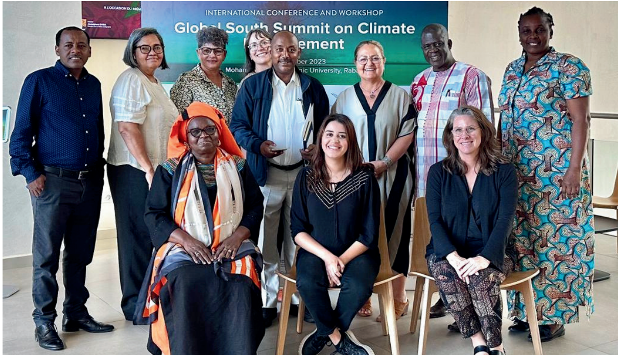
Chair attending a conference on Climate and Health in Rabat, Morocco