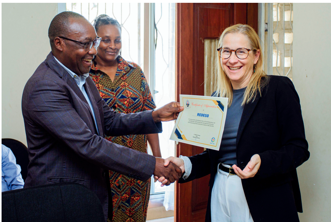
REDESO's Director receiving certificate of appreciation for hosting the interns and conducting outreach with the Research Chair on Forced Displacement