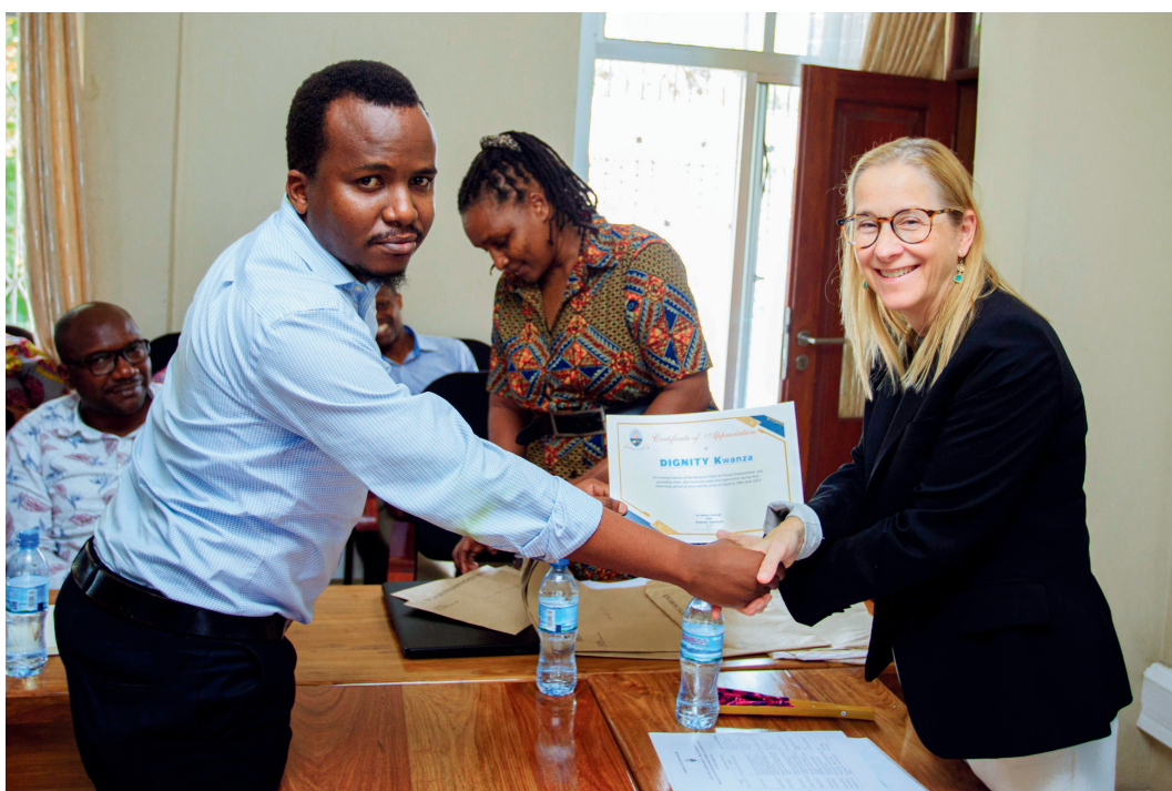
Dignity Kwanza's representative receiving a certificate of appreciation for hosting the first cohort of the interns and conducting the outreach with the Research Chair