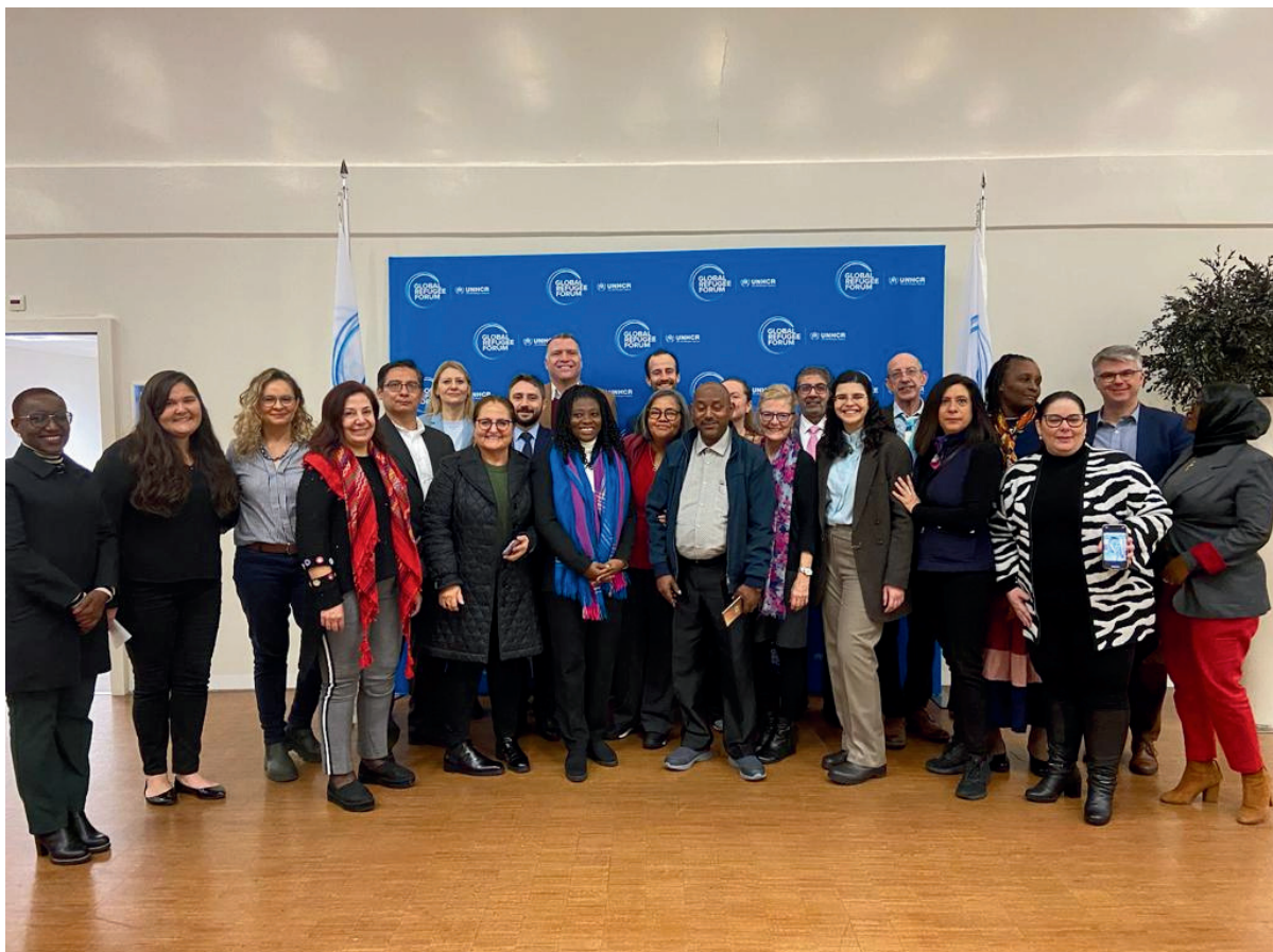
12 Chairs in Geneva with other delegations