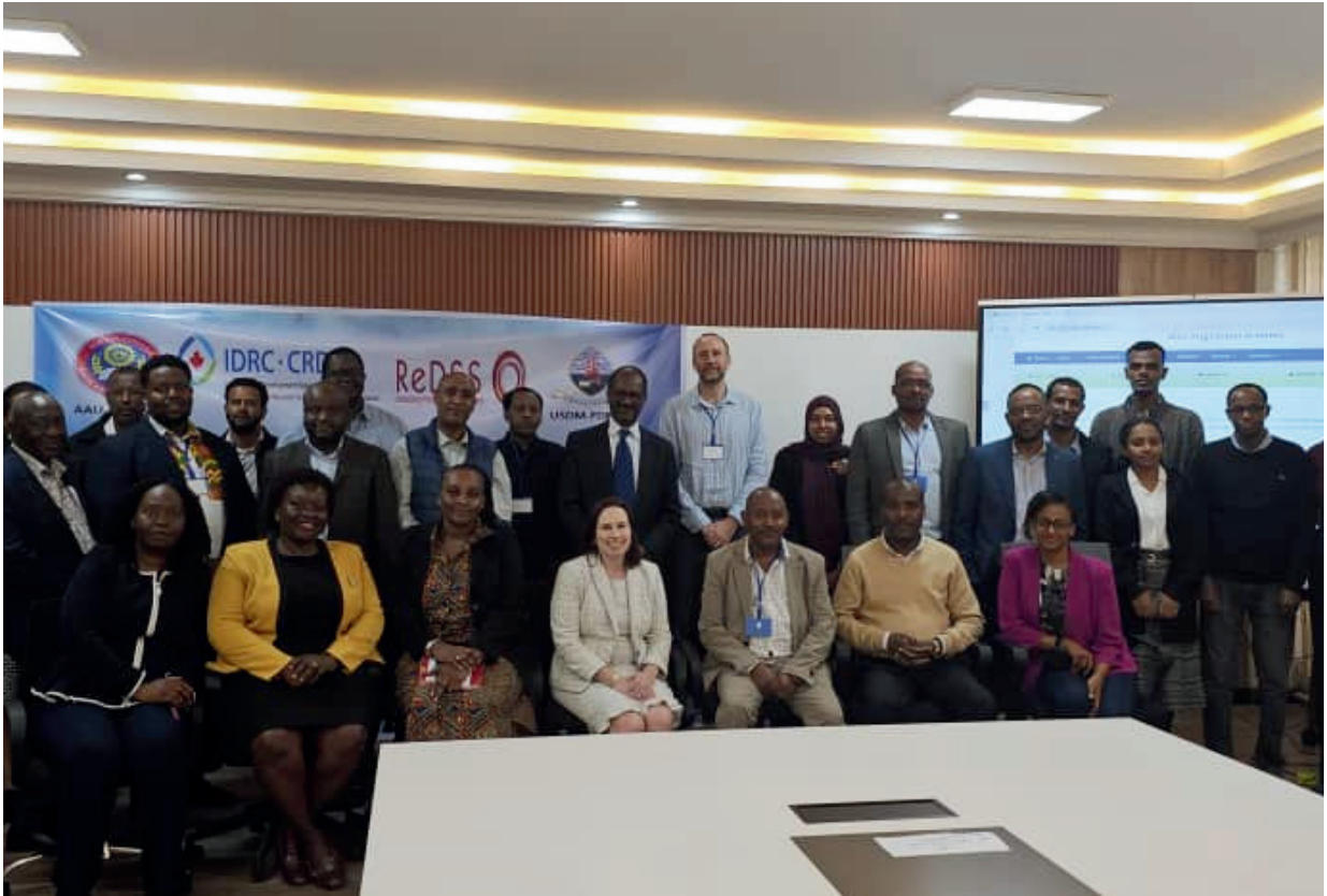
Towards a network of academic scholars on forced displacement in East, Horn and Great lakes region of Africa