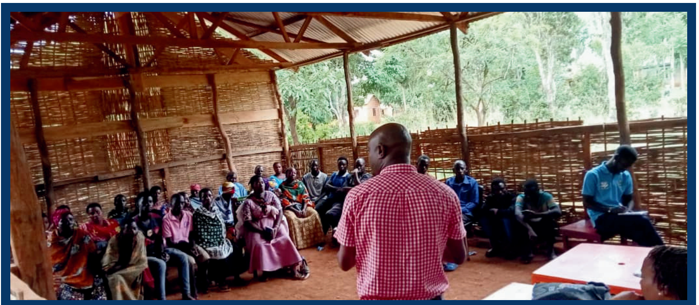
Outreach at Nduta Refugee Camp, Kigoma

The inflow of refugees has worsened existing land-related problems in Uganda. Tensions have arisen between host communities and refugee populations as a result of competition for limited resources. Land conflicts have erupted into violence in certain situations, further exacerbating the issue. One example is the Kiryandongo Refugee Settlement, where confrontations between host populations and refugees have been documented. The strain on available land resources has fostered discontent and increased the possibility of war in the region.