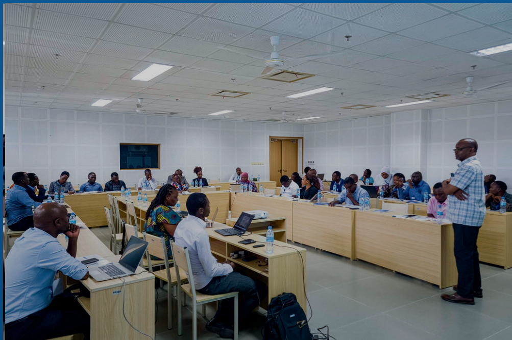
Participants during the symposium