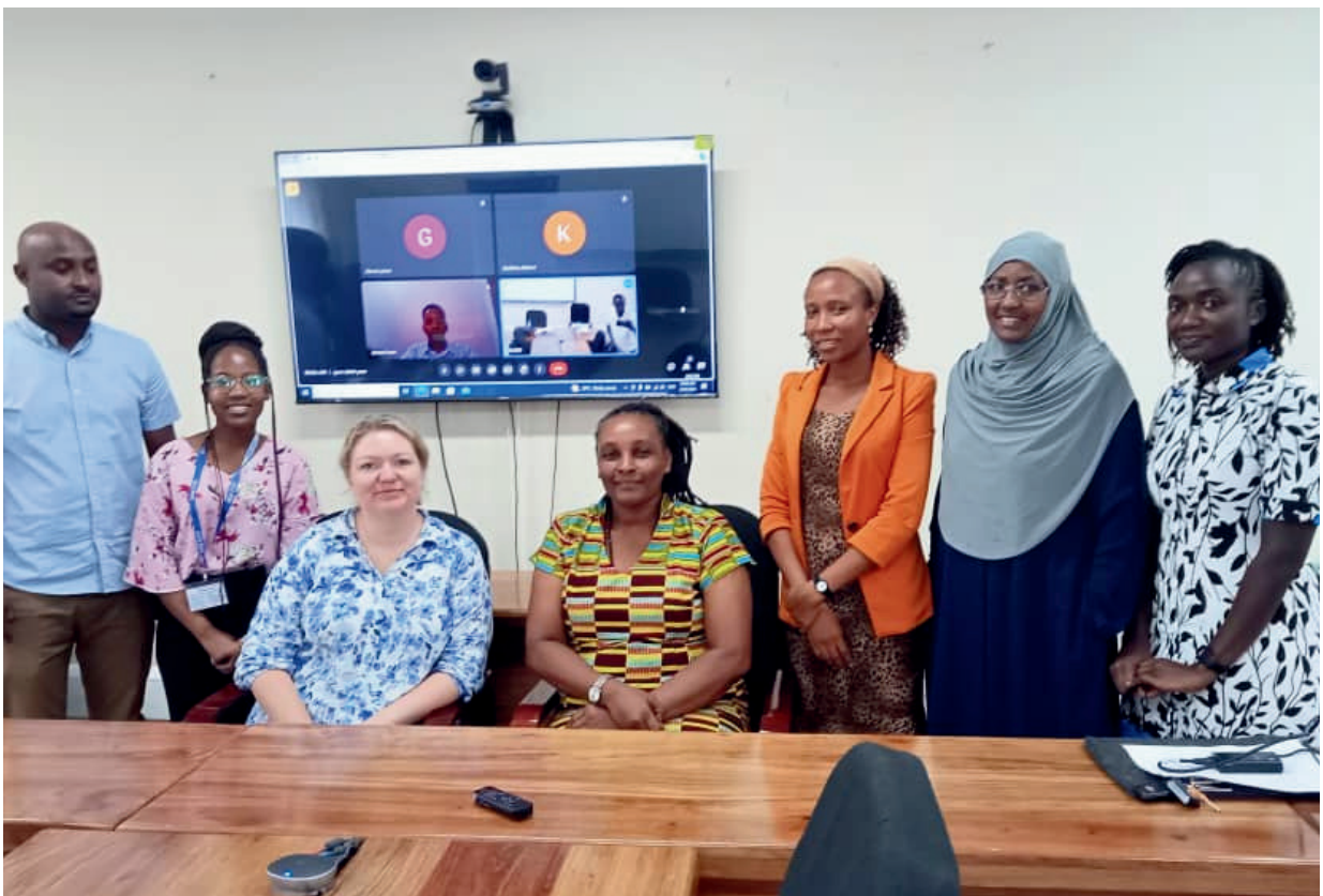
A visit of Elysia from ReDSS