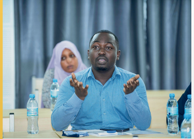
A representative from the Government