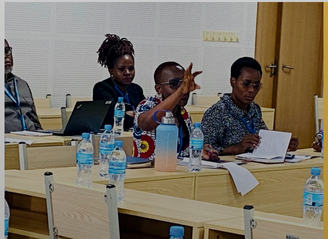
A representative from Dignity Kwanza Contribution in the Symposium