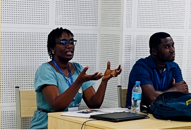
A representative from International Rescue Committee (IRC)