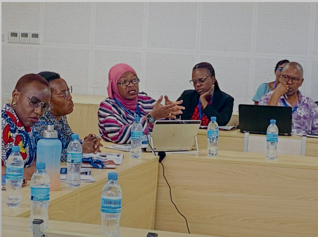
Sitting in the Middle is a representative from the Immigration Department