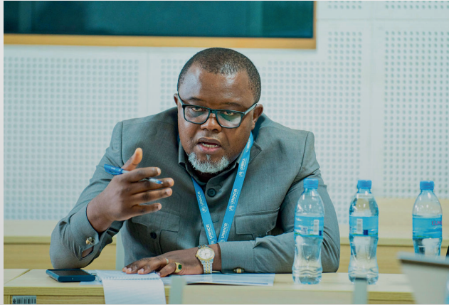
A representative from United Nations High Commission for Refugee (UNHCR)